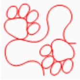
Pawprints B2B Fill Border Corner