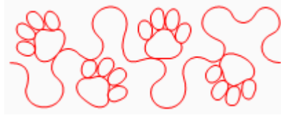
Pawprints B2B Fill Border